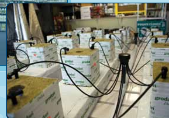
America's best features a custom grow room to help further educate customers.